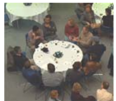
Agency representatives listen to others speak on their experiences with the

Agency representatives had a chance to network with other representatives and gained knowledge on the system as a whole. Overall, it was a win/win experience for all attendees.