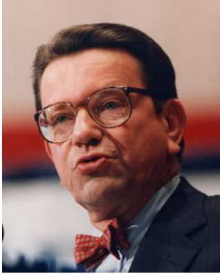
The essay will reflect the ethics upheld by the late Paul Simon.

Beginning in January, 2005, Illinois Issues magazine will launch what is to be an annual essay on government ethics in honor of the late Senator Paul Simon. A founder of the magazine, Simon served on the board until his death in December, 2003. The essay, created in his memory, will approach the subject of ethics in government on a very broad level, including such topics as leadership and civic