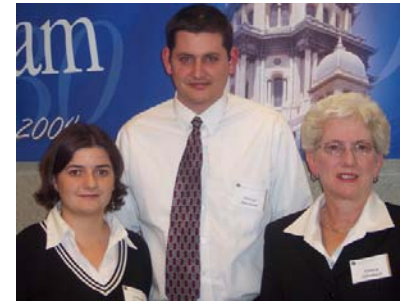
“The GPSI Family”