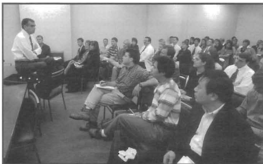
Illinois Congressman Ray LaHood talks to GPSI program interns during their orientation.

Interns begin a professional career with state government and simultaneously earn a master's degree. They gain valuable work experience and insight into the operations of Illinois government and receive a monthly stipend, tuition, and a modest travel allotment.